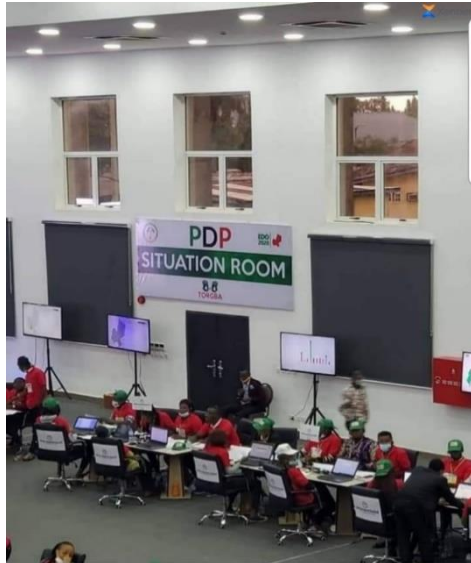
PDP Situation Room.

that PDP won the election. The high level of Election day internal coordination within the PDP is commendable, and one that other parties can learn from.