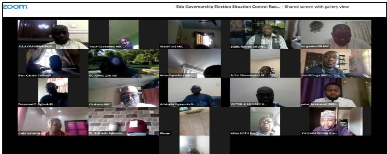
INEC Virtual Situation Room

Another innovative measure adopted by INEC and which is in compliance with Covid-19 pandemic protocols was the use of a virtual situation room. This involved INEC management, national commissioners, and directors tracking the process via Zoom. As a result, INEC officials were able to give rapid responses to arising issues at different locations. The virtual situation room was also used to respond to reports and complaints from the public. For example, one polling unit was reported to be involved in vote buying and INEC immediately responded to this, ensuring that the vote buying was stopped. In this way, INEC ensured that even with the COVID-19 pandemic, distance was not a barrier to tracking and responding to events at the election in real time.