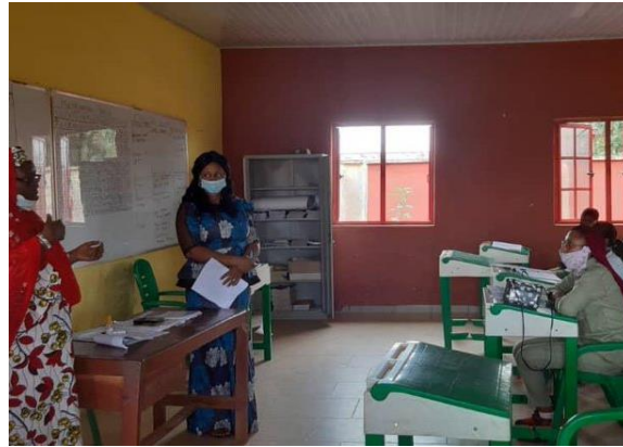
INEC national commissioners training POs and APOs in Edo. Source: INEC 19